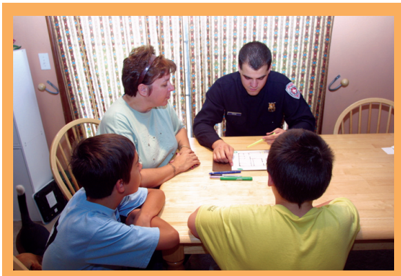
Figure 2: A family makes a home escape plan.

A home escape plan is your way out of your home if you have a fire. After you plan your escape, all family members should practice the escape plan every six months. The more you practice your escape plan, the more prepared you will be to take action in an emergency.