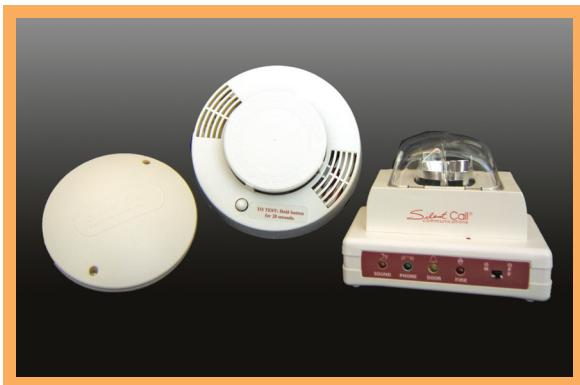
Figure 1: A smoke alarm for people who are hard of hearing.

You need at least one smoke alarm outside every sleeping area and on every level of your home. The most dangerous fires occur when you are sleeping. The smoke alarm should detect the smoke before it reaches your sleeping area and wake you up.