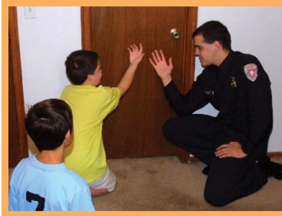
Figure 3: Feel the door with the back of your hand.

If the door does not feel hot, open it with caution. There still may be smoke and heat on the other side. If you open the door and find smoke or heat, close the door, and use your second way out. If the path to the outside is clear of smoke, or if you can crawl under the smoke, move quickly to the exit (see Figure 4).