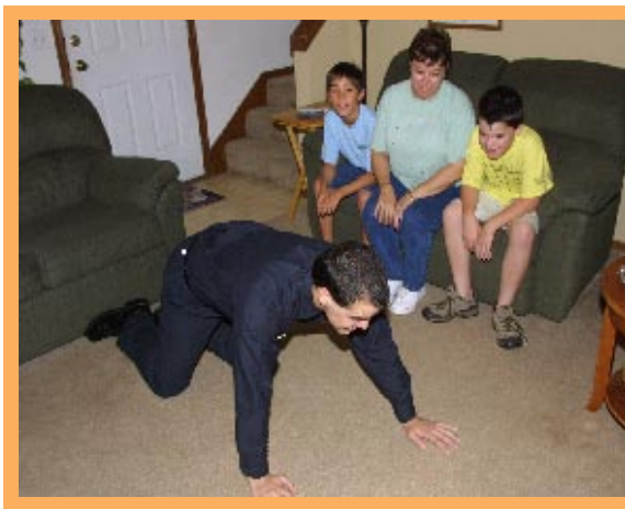
Figure 4: Practice crawling to get under smoke.

If the door does not feel hot, open it with caution. There still may be smoke and heat on the other side. If you open the door and find smoke or heat, close the door, and use your second way out. If the path to the outside is clear of smoke, or if you can crawl under the smoke, move quickly to the exit (see Figure 4).